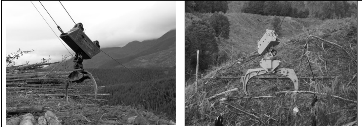
Figure 3. Motorised grapple carriers – Falcon Forestry Claw with internal motor (left) and hydraulically powered Alpine (right).