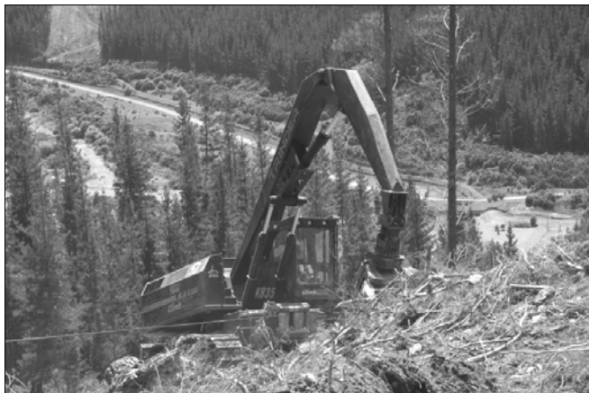
Figure 1. ClimbiMAX felling machine with winch integrated into chassis.

This paper is based on: "Mechanising steep terrain harvesting operations", authored by Rien Visser, Hunter Harrill and Keith Raymond, published in the NZ Journal of Forestry, November 2014, Vol. 59, No. 3.