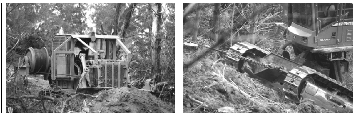
Figure 2. Purpose-built self-levelling harvester (right) being cable-assisted by the winch mounted on the dozer (left).